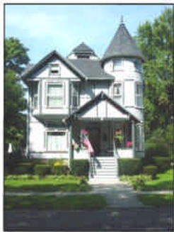
9 - 505 N. Franklin St.