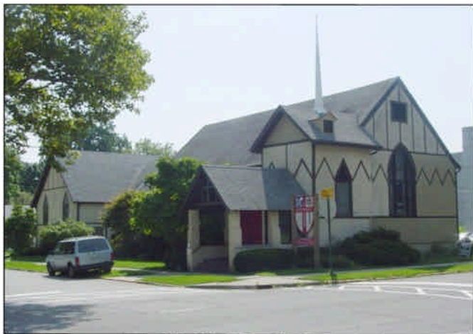
28 - 208 N. Franklin St.