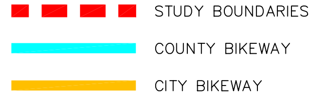
Figure 12: EXISTING BIKEWAY SYSTEM GROWTH MANAGEMENT PLAN Valparaiso, Indiana