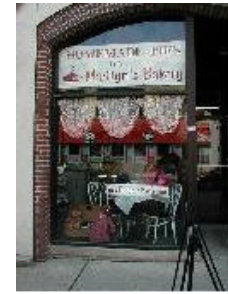
112 E. Lincolnway Valparaiso, IN 46383

mand. Revisions to their business plan have already included offering the customers the “extras” that they have requested. Donuts, cookies, and breads are the new items brought into the